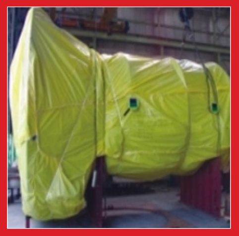
XF Silpaulin Packaging Sheets