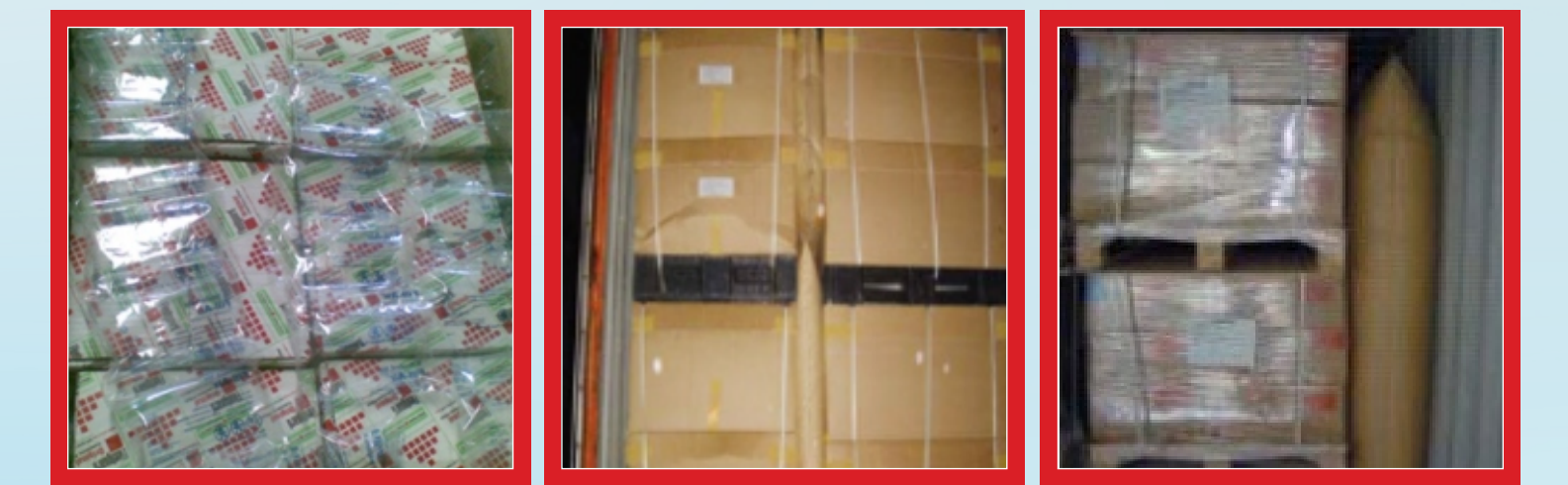
Void Filling Air Bags