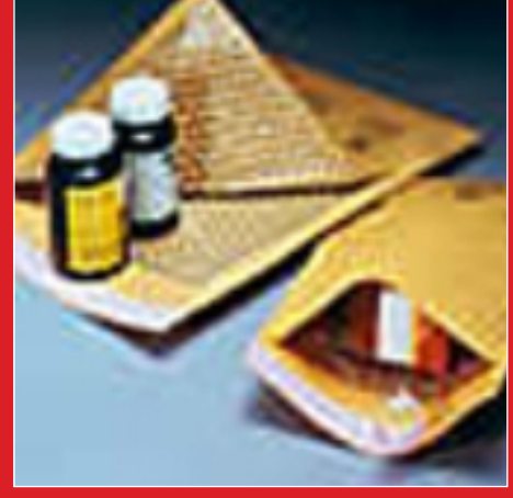
Plastic Bubble Envelopes