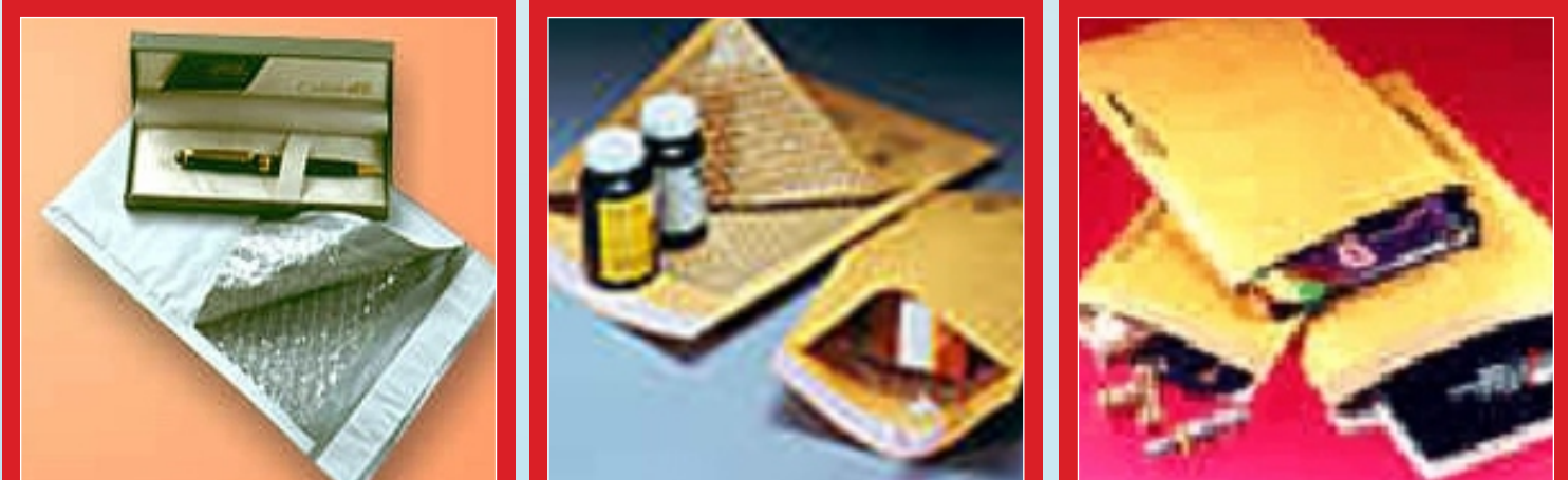
Bubble Packaging Envelopes