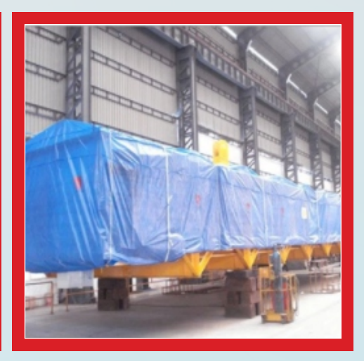
Silpaulin XF Film