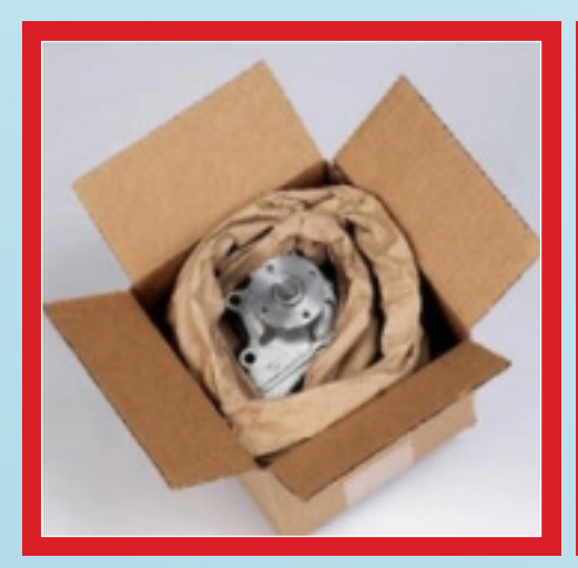
Pack Tiger Cushion Papers